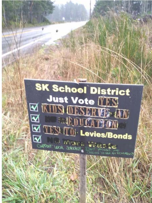
(example of defaced sign)

The Kitsap County commissioners responded immediately denying they ordered nobody to remove levy signs either for or against the SKSD levy. On 25 January 2021 the Port Orchard City Mayor responded assuring me that absolutely nobody was removing SKSD levy signs. Two out of three groups have responded to my question about opposing levy sign removal. South Kitsap School District (SKSD) school board is the only one that did not respond to my question on the signs.