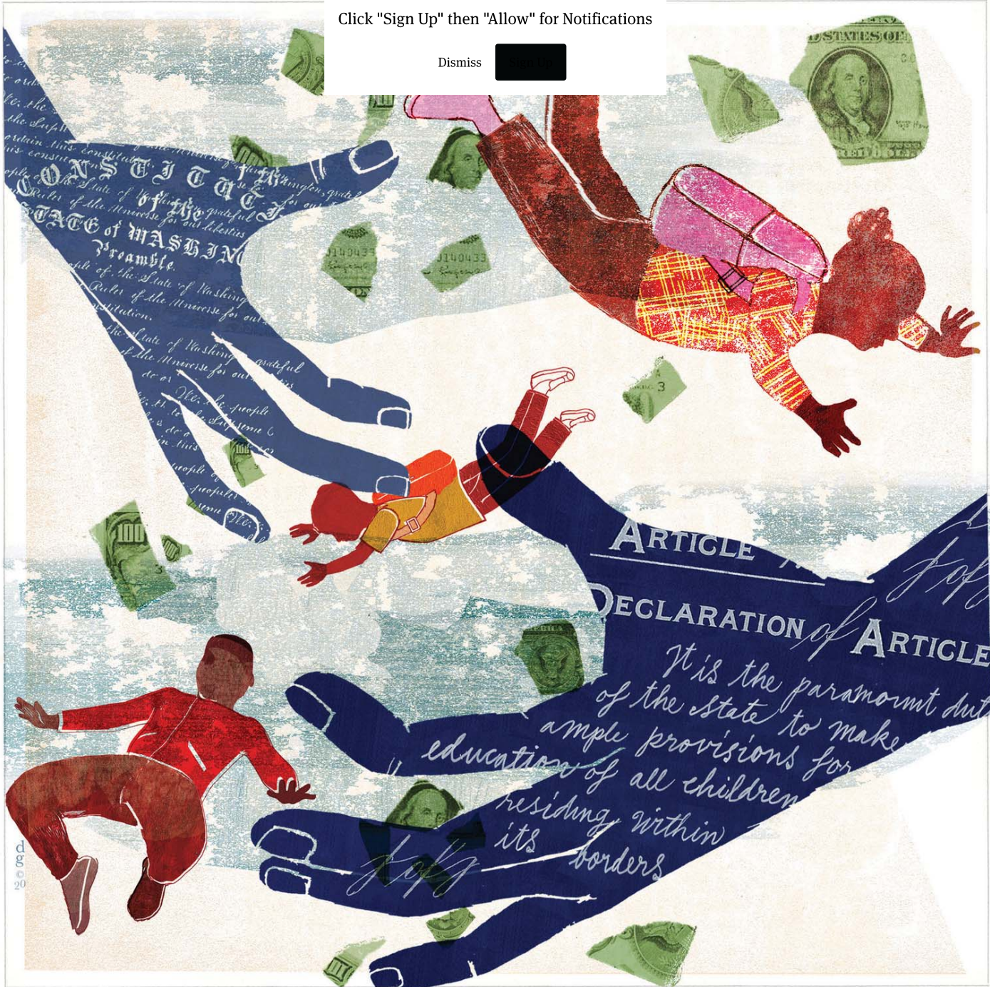
(Donna Grethen / Special to The Seattle Times)