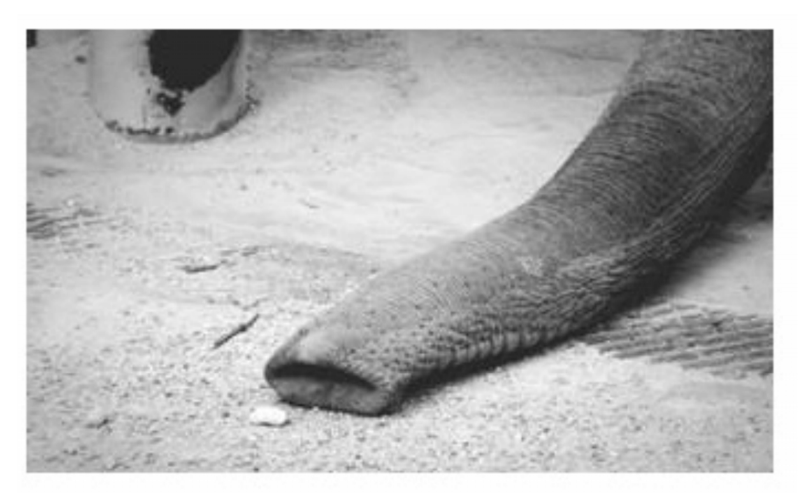
(No Small Nuts!)